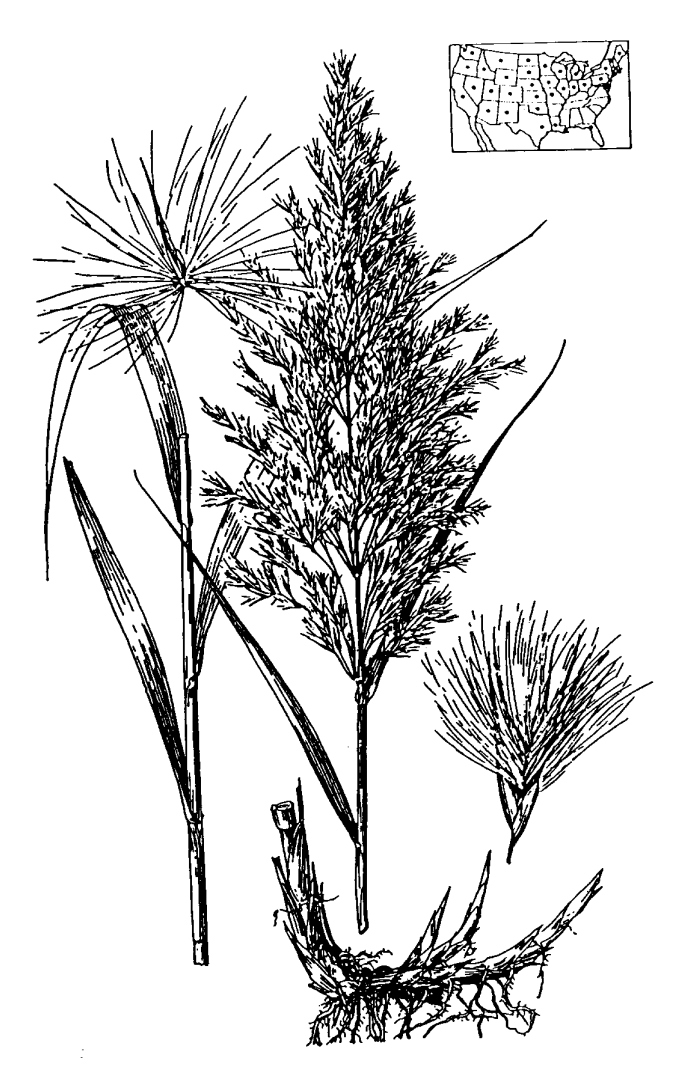
Figure. Phragmites australis plant (× ½), spikelet and floret (× 3), and rhizome. Illustration from Hitchcock (1950).

mud roots with small lateral roots that reach down 3 ft (1 m) or more grow from the horizontal rhizomes.